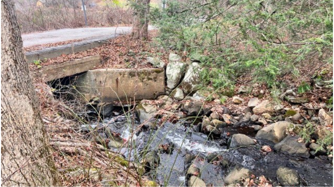
Looking North into Existing Culvert