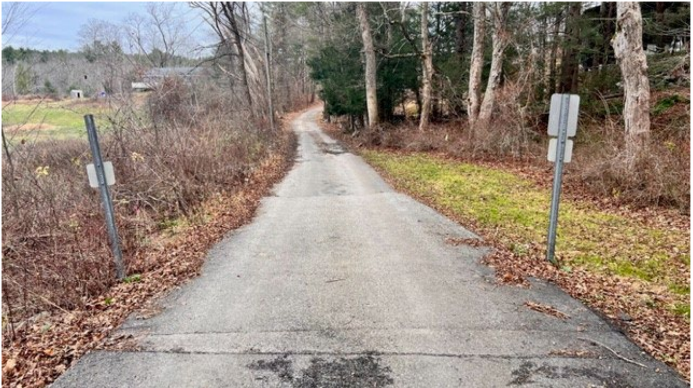
Pumping Station Road Looking East Towards Gurleyville Road