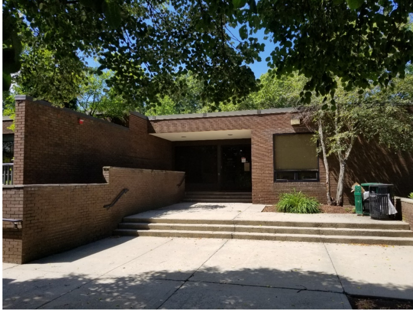
Tasker Admissions Building Main