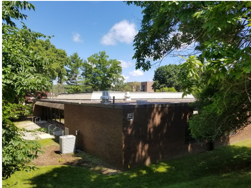
Tasker Roof seen from the southwest