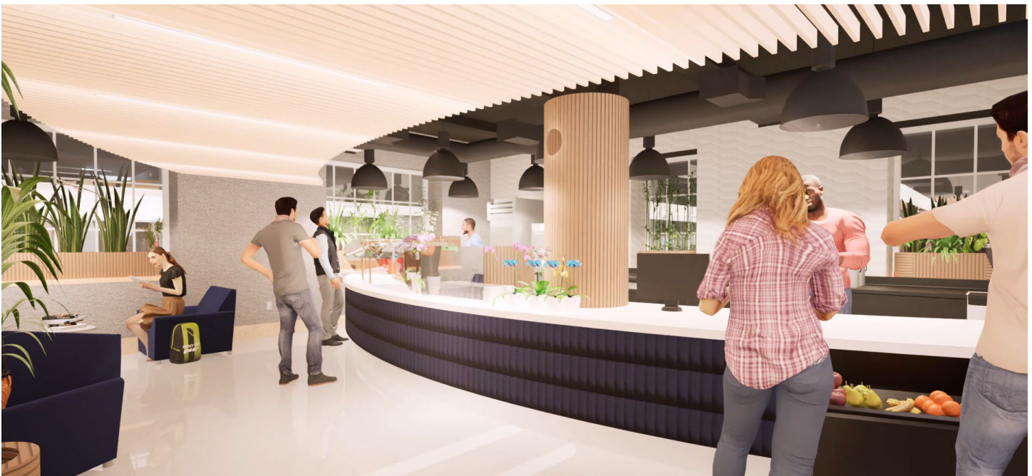
Rendering of new café area with food prep, display, and transaction counters.