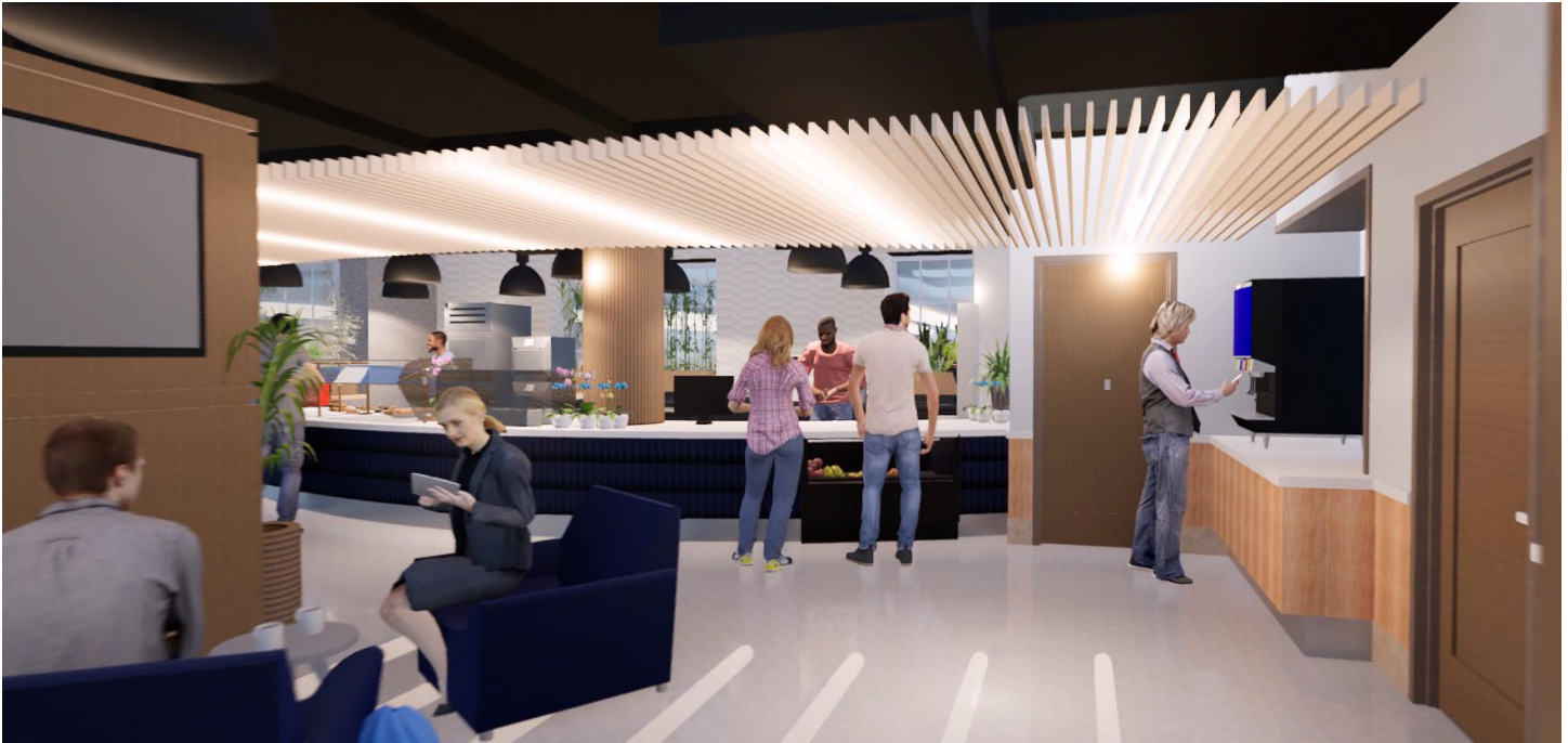
Rendering of new café area with food prep, display, and transaction counters.