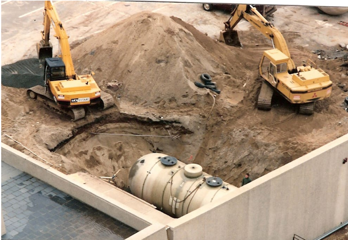
Example Underground Storage Tank