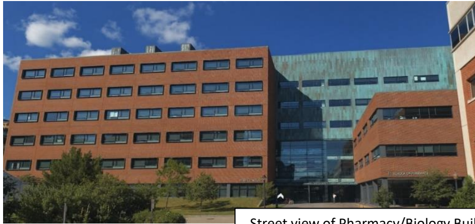
Street view of Pharmacy/Biology Building