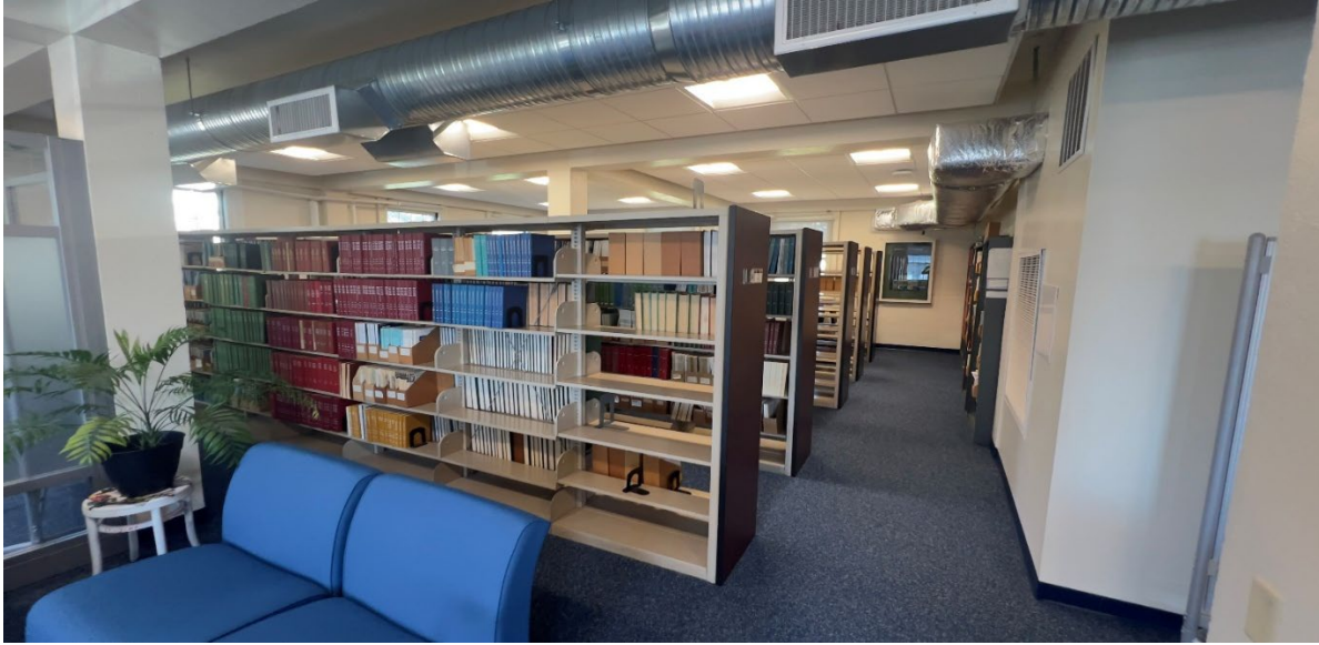
New Office Location